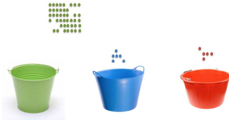
Figure1: Stratification of patients based on the risk factors

The next step after defining the risk factors of an individual is stratification of the subjects which can be either simple or complex